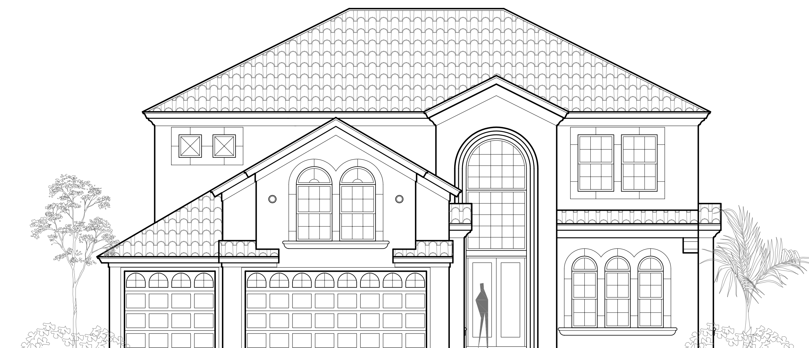
C FRONT ELEVATION SCALE: 3/16" = 1'-0"